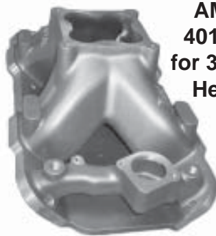
AMC 401-3X for 300cc Head