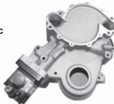
AMC 401-25 Front Cover with Billet Pump

***See Page 2 for Important Payment and Shipping Information***