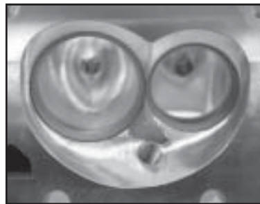
440-1CNC 325 or 345cc Intake Runner